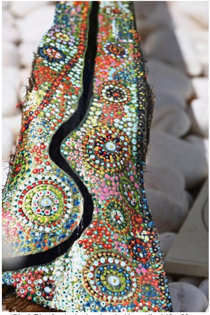
"Black River" palm bark painted with acrylic, 142 x 38cm

Artist e.wasserhase shares an unusual collection of aboriginal-inspired art painted on palm bark. See more by visiting their website.