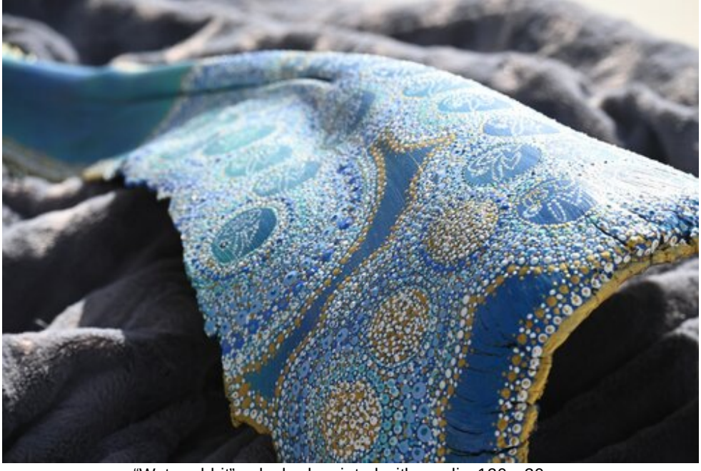
"Waterrabbit" palm bark painted with acrylic, 120 x 30cm

The period of COVID changed my perspective on life. I felt it was time for new adventures and for raising my awareness about the environment and the beauty of nature. I always had a passion for the arts, especially photography, stone sculpting, pottery and painting, which I practised whenever I had time.