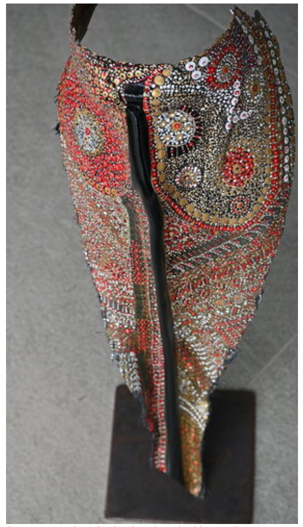
"Picasso's Owl" palm bark painted with acrylic, 20 x 75cm