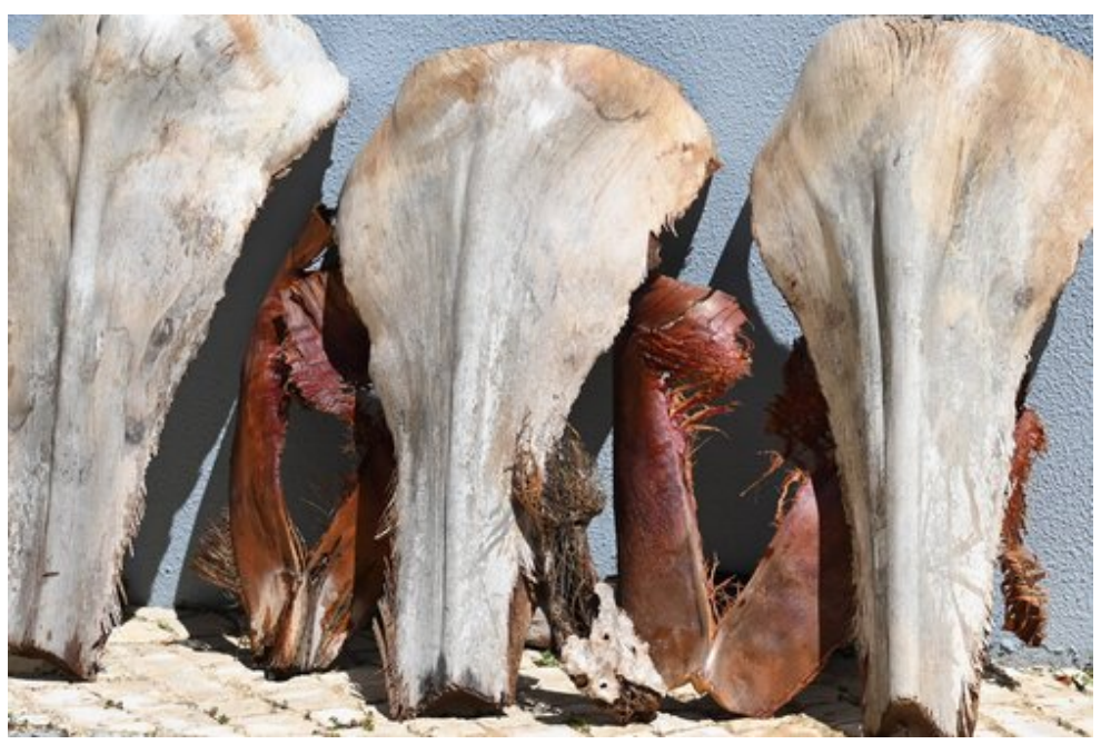
Palm bark is used as a found material for e.wasserhase's work

The period of COVID changed my perspective on life. I felt it was time for new adventures and for raising my awareness about the environment and the beauty of nature. I always had a passion for the arts, especially photography, stone sculpting, pottery and painting, which I practised whenever I had time.