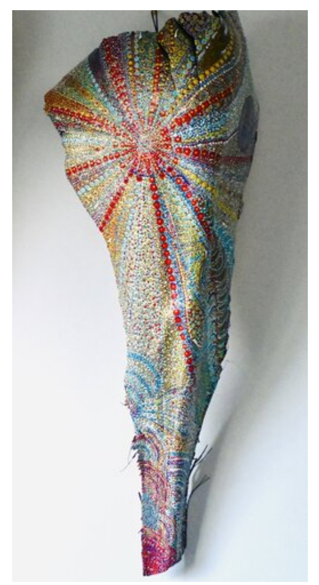
"Goddess Hive" palm bark painted with acrylic, 85 x 40cm

In 2018, when my mother died, I developed a fascination for the beauty of natural materials which people consider waste, but which are very much like wood. My father had just died a few years prior and I still felt the pain. I cleaned the churchyard for my mother's funeral and found palm bark which I took home and started painting with her paint.