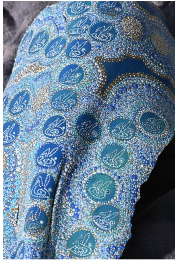
"Waterrabbit" palm bark painted with acrylic, 120 x 30cm

I have two publications: Contemporary Amazons and Art and Songs for Mother Nature . The first is a play with the femininity of the art pieces owing to their shape. The second is a joint venture with my husband who is among many other facets a poet. I have exhibited my pieces in the Algarve of Portugal and Andalucía, Spain. My next exhibition is upcoming in Andalucía.